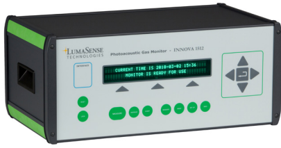
INNOVA 1512 Photoacoustic Gas Monitor.