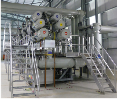
High-voltage SF 6 Gas-Insulated-Switchgears (GIS) are solutions more and more privileged by T&D operators in need for compact and enclosed substations.