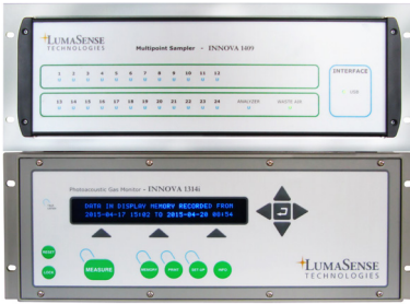
SF 6 Leak Detection System - 3731