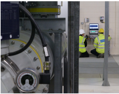
LumaSense's SF 6 leak detection system is a cost-effective solution to comply with SF 6 emission regulations.